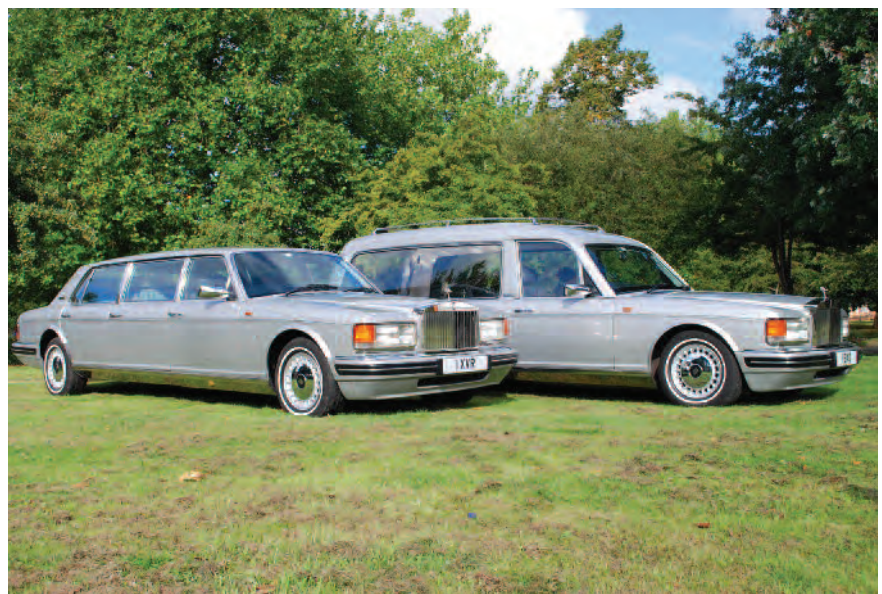
Part of our modern funeral fleet