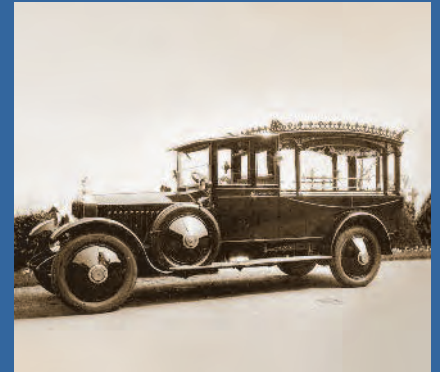
Our first motor hearse

The decision as to whether to include a contribution towards these third party payments is entirely your own decision, but our staff are available at any time to give advice in relation to this.