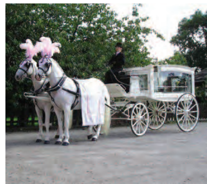
A white hearse and pair of grey horses

Please take time to read the terms & conditions relating to the Perfect Choice Funeral Plan that accompany this brochure.