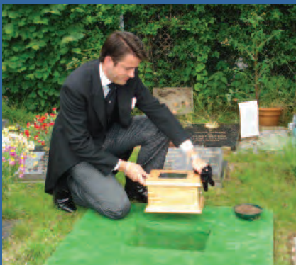
An interment of cremated remains

One of the major benefits of choosing an A.W. Lymn Perfect Choice funeral plan is that you can choose a plan that exactly meets your requirements. We would always recommend that you discuss your requirements in detail with our funeral directors. We can then write a personal plan to exactly cater for all your requests.