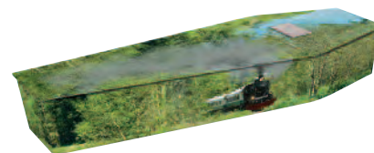
An example of a bespoke coffin