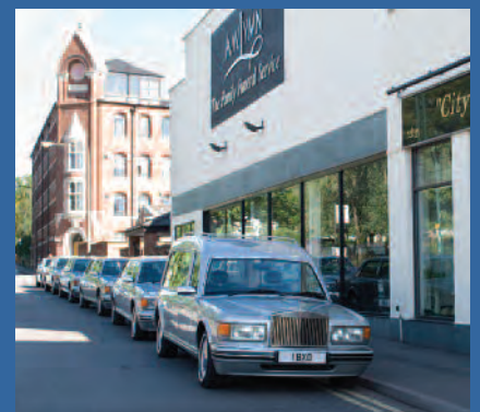
Our Nottingham head office