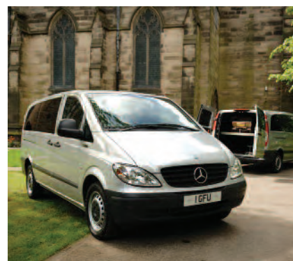
Our closed hearse