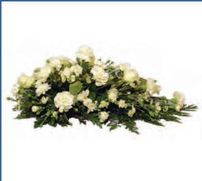
A single-ended spray