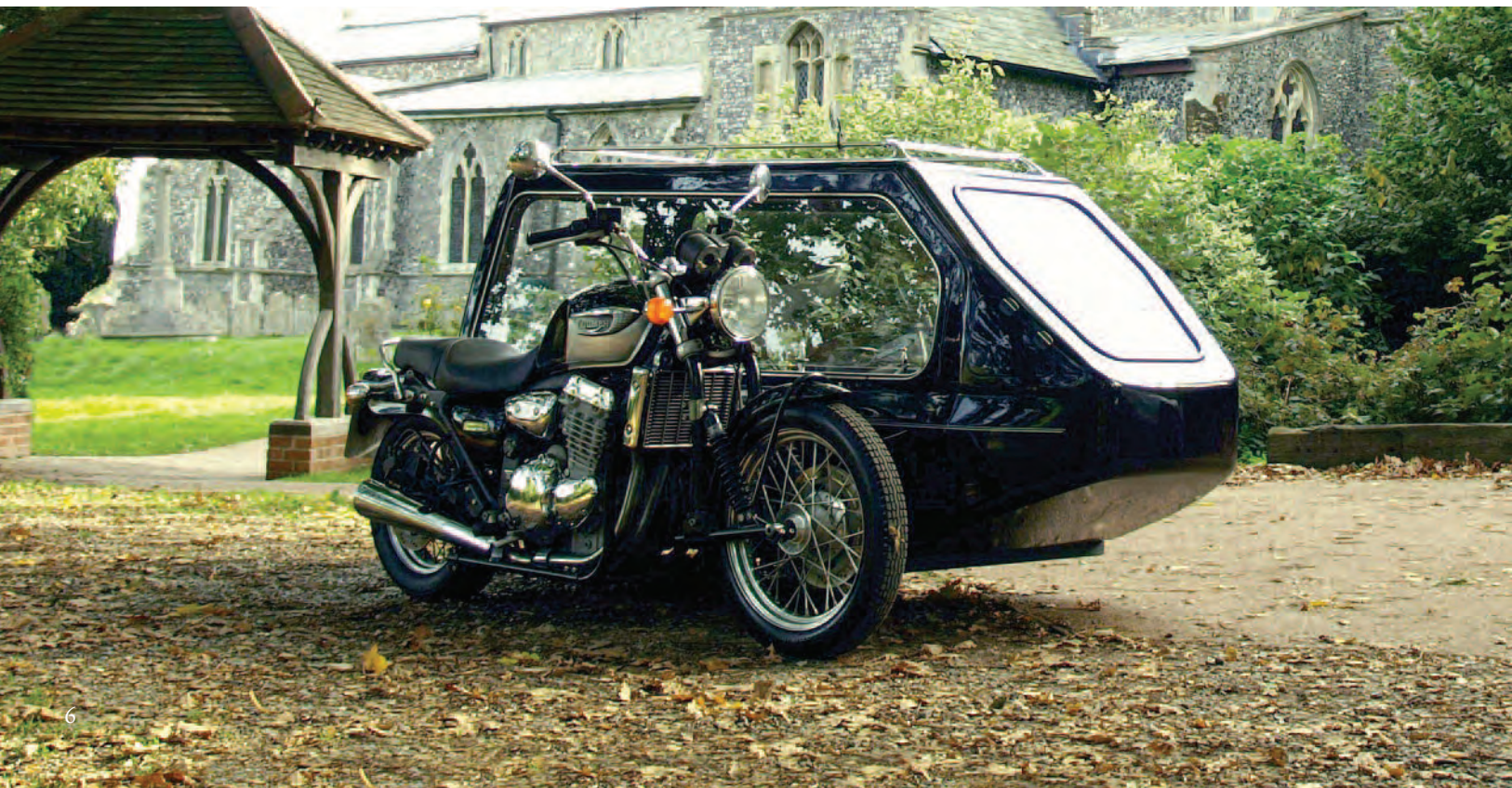
A motorbike hearse