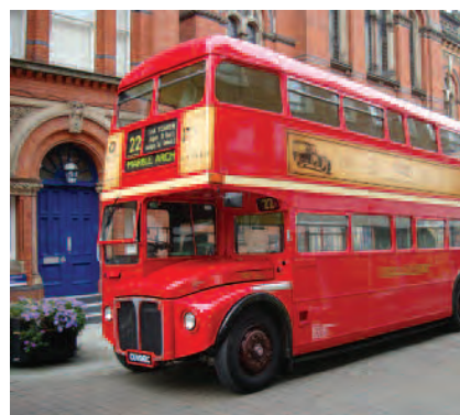
Our Routemaster bus can be used as a hearse or for mourners

Please note: this plan does not include any out of hours work, any viewing facilities, any limousine, any church service, the hearse does not go to the family home and the plan is only available for cremation.