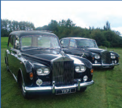
Our Rolls-Royce Phantom VI funeral fleet