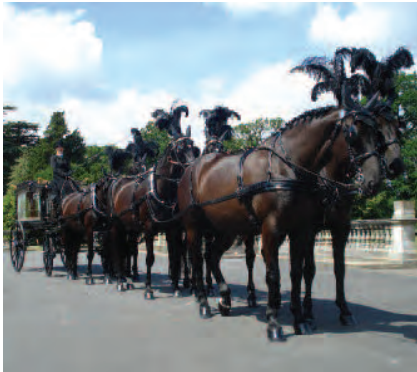
Our horse drawn hearse with six horses