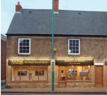
One of our branch offices

*Please refer to the Terms & Conditions for full details.