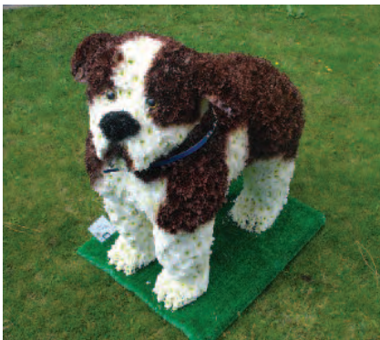
A dog tribute made out of flowers