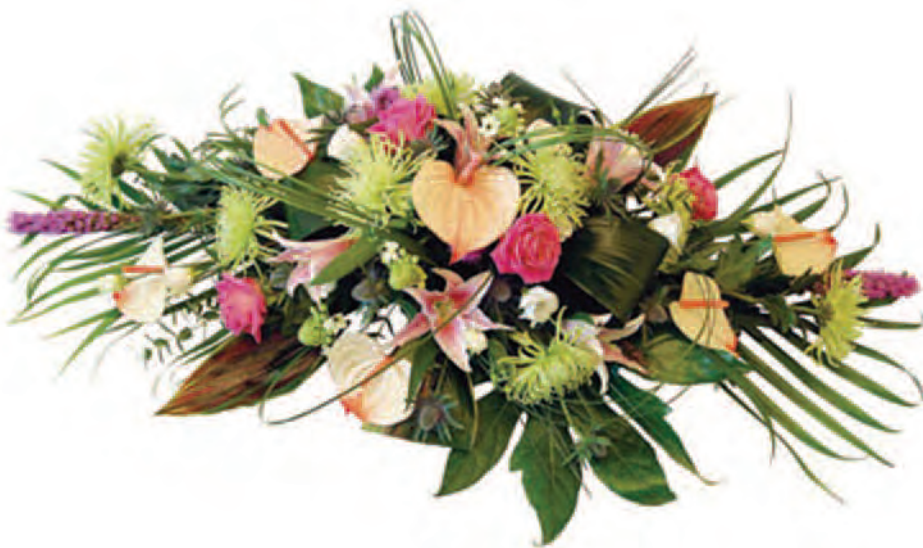
A modern double-ended spray

A.W. Lymn, The Family Funeral Service, and NAFD Services Ltd. will give you the guarantee that the funeral arrangements requested in your Perfect Choice Funeral Plan will be carried out to the letter when the time comes. You will also be protected by the strict Code of Practice operated by the NAFD for the benefit and protection of their member's clients.