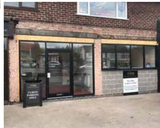
Stage one of the Rainworth refurbishment is complete Photographs and ground plan on page 2