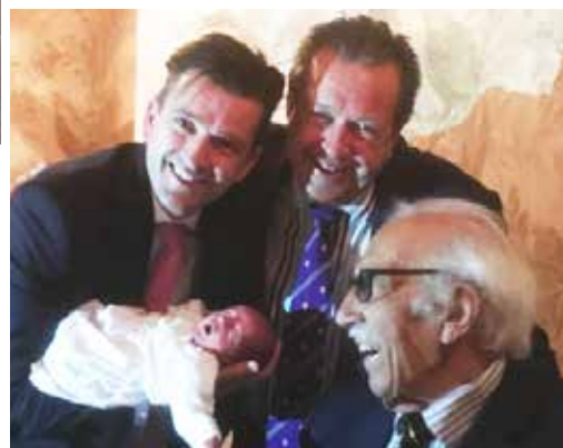
Company Dinner 2018