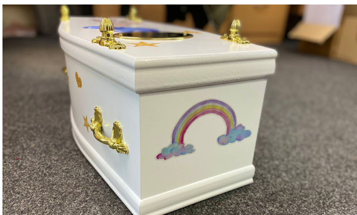
A family decorated a baby coffin with 'nursery' stickers to make it more personal.