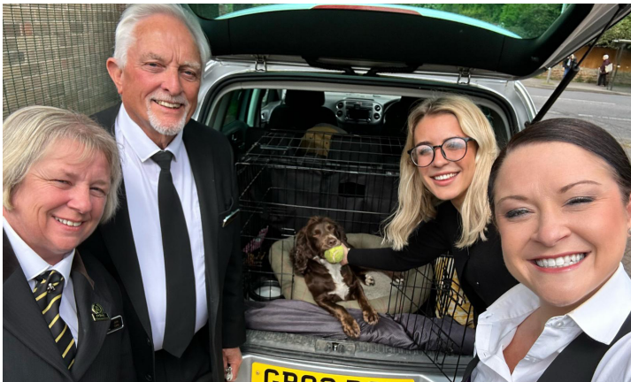
Wollaton welcome a special visitor.