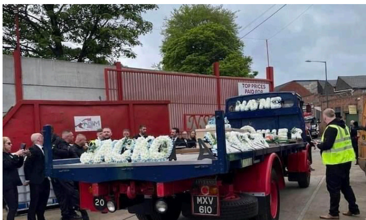
Emma Hind arranged a funeral with the lorry for a local man where 30 vans showed up to escort him!